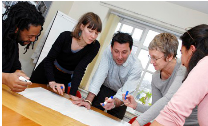
Figure 1.1: Workshops and exhibitions can be a fun and interactive way to gather views on the future of an area.